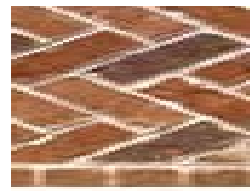
masonry or brick