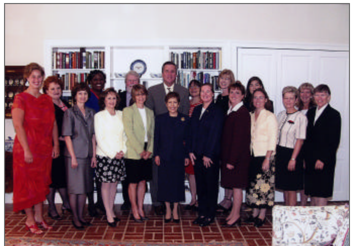
Representatives from the 15 funded organizations with Governor Bush at the award ceremony.