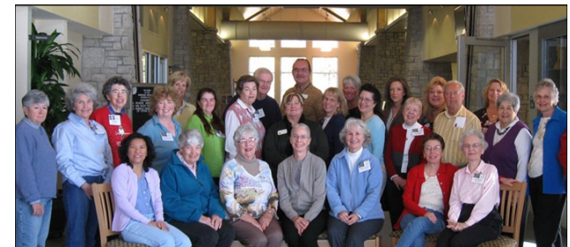
First graduating class of tutors, November 2008